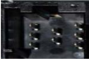
Image of 8-pins CD changer interface: