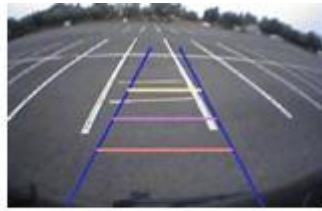
Ajustable guide lines