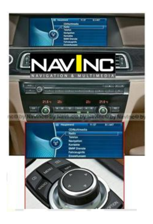
iDrive CIC2 Professional navigation system