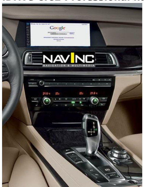
iDrive CIC2 Ghost: