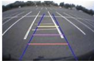
Ajustable guide lines