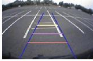
Ajustable guide lines