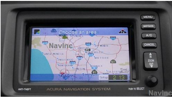
Image of suitable navigation systems: 12-pins Acura navigation system