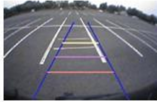
Ajustable guide lines