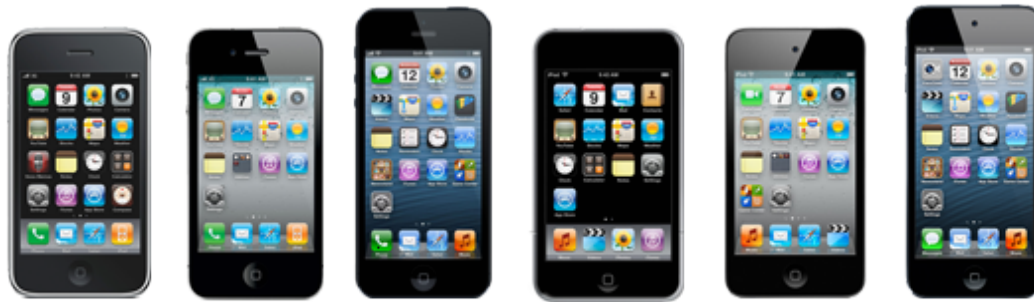
iPhone 3G/3GS iPhone 4G/4GS iPhone 5 Touch 2G/3G Touch 4G Touch 5G