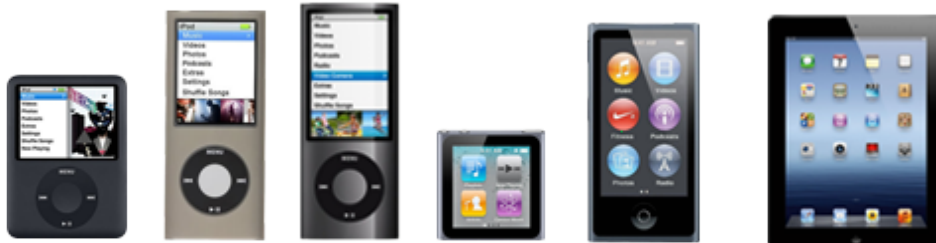
Nano 3G Nano 4G Nano 5G Nano 6G Nano 7G iPad 1/2/3